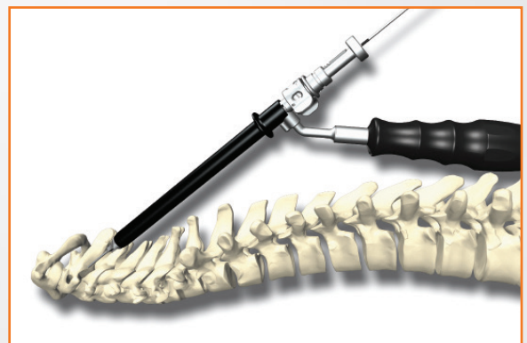
MIS C1-C2 transarticular procedure option available