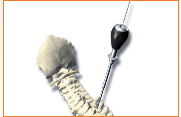
Cannulated screws available for placement and positioning of screws