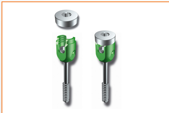
Uniquely designed low profile locking screw captures the outside of the tulip to improve overall construct stability and minimize splaying